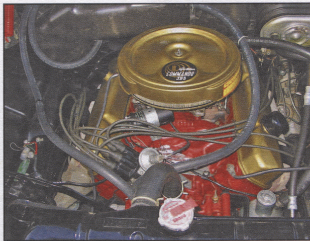
"Golden Commando 395" 361 CID engine

"For '59... If It's New, Plymouth's Got It!"