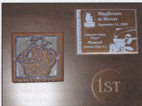
First place trophy from the POC 1999 National Fall Meet

In 1999, Ed's Sport Fury took First in Class 5 (1955-59) at the Plymouth Owners Club National Fall Meet, being awarded 97 out of 100 points.